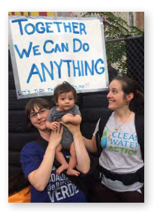
CLIMATE CHANGE IS WATER CHANGE: At the September Climate March in New York City.

Clean Water Fund helps reduce reliance on dirty fossil fuels, substituting clean renewable energy to save money, create jobs and reduce pollution. Clean Water Fund is also organizing public support for new federal protections to address power plants' water pollution, restrict discharges of polluted oil and gas wastewater, and cut back on global warming pollution.