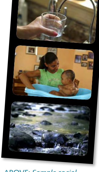
ABOVE: Sample social media outreach materials.