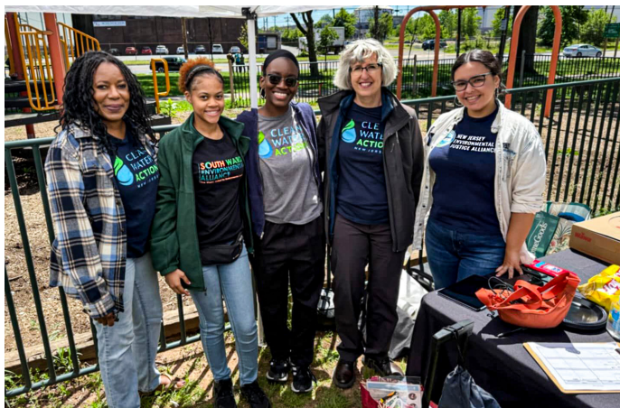
▲ Coalition of Healthy Ports members pictured after the Truck Count in Elizabeth, NJ.